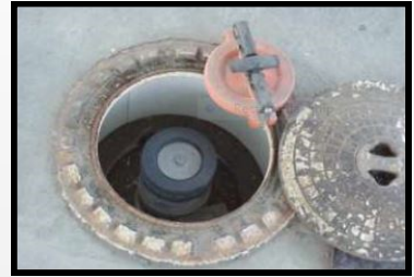
Steps 8-9 - Covers