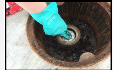
Step 11 - Poppet Valve