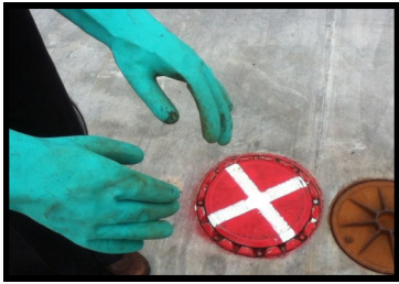
Step 1 - Safety