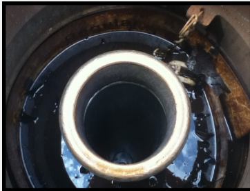
Step 3 - Fill Tube