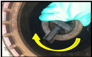
Step 5 - Dust Cap