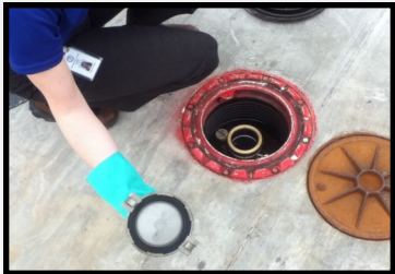
Steps 3-4 - Gasket