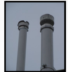
Steps 14-16 - Vent Risers