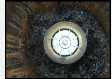
Step 10 - Gasket