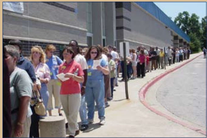
Volunteers wait in line at a dispensing exercise.

But not for you and your employees. You planned ahead, and are activating your CLOSED Dispensing Site. Your employees know that they and their families can avoid the public dispensing sites and get their medications at work. With important paperwork already on file, the process is quick and easy. Your employees and their families are protected from harm, and your business keeps running smoothly.