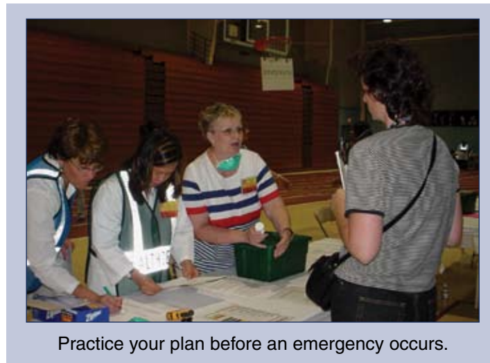
Practice your plan before an emergency occurs.